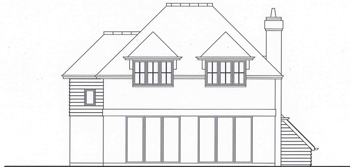
HOUSE 2 - REAR ELEVATION