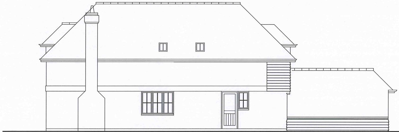
HOUSE 2 - SIDE ELEVATION